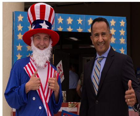
Special Thanks to Marine Corps Base Camp Pendleton for sending us these great shots from their voting events on May 25, 2017!